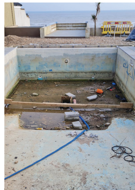
Swimming pool as we found it